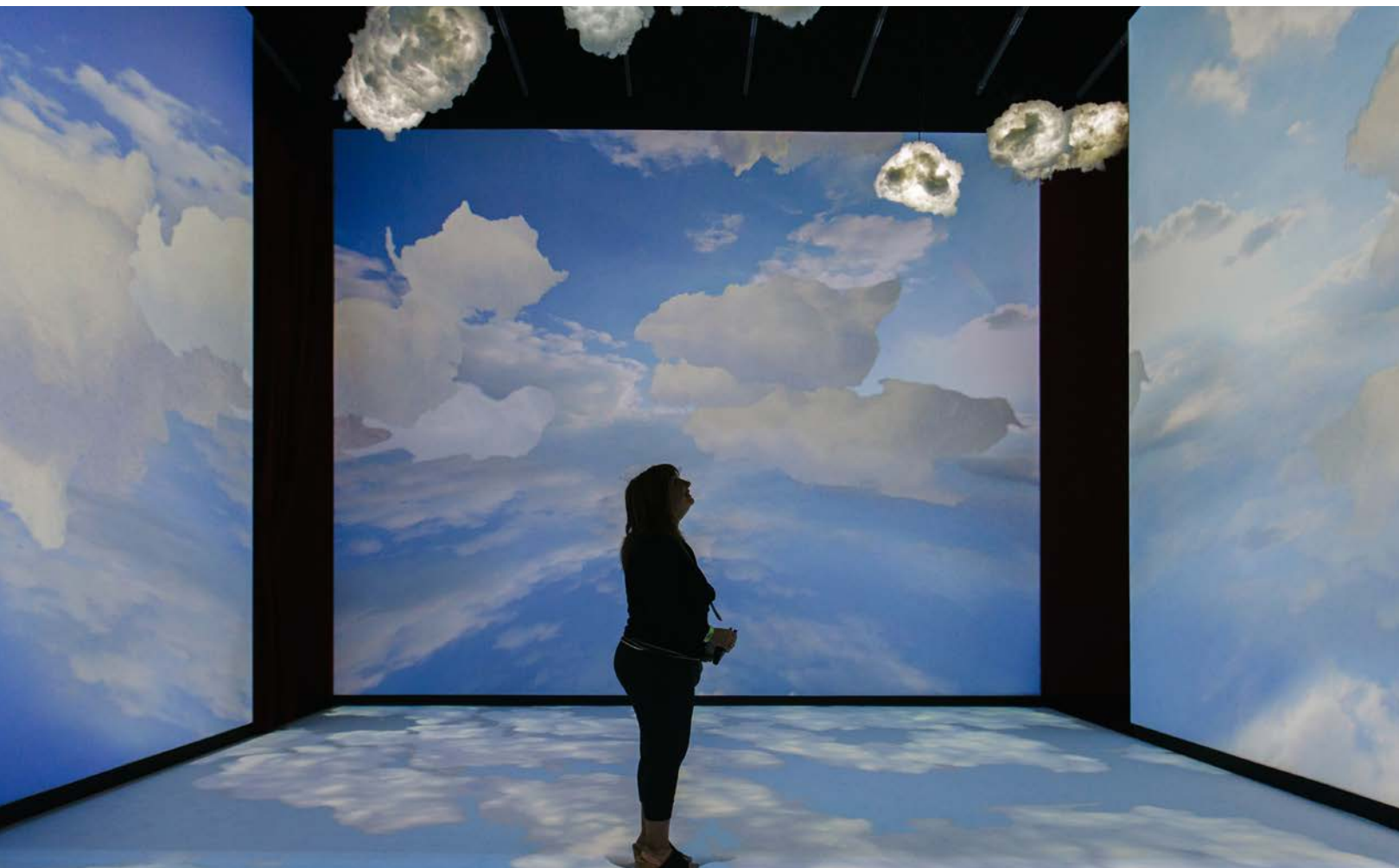
The Dalí Museum: Magritte & Dalí Exhibit.

Consistent funding for the arts economy is an intractable challenge. If we fail to solve the funding challenge now, we will embark on a new strategy process in a few years and reach the same conclusion. To avoid this redundancy, we recommend that leaders work together to deliver dedicated, ongoing arts funding to support the Arts Alliance's citywide work and collaborative activities.