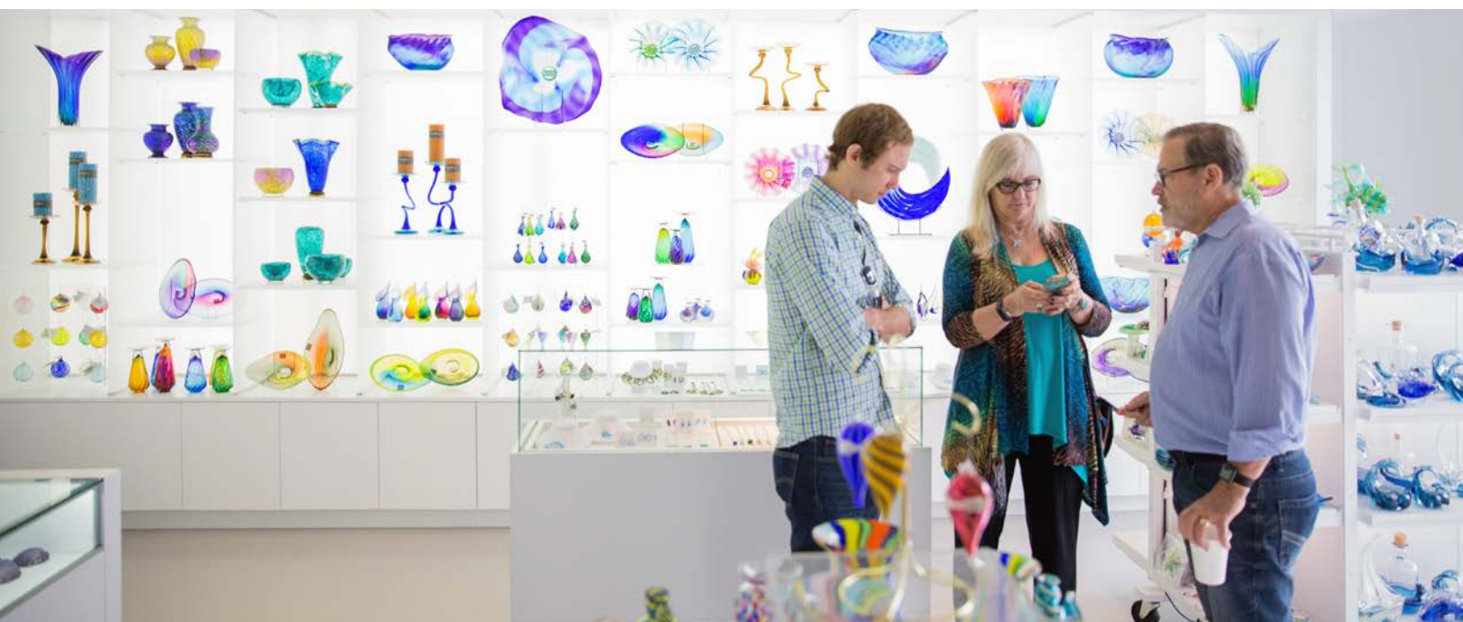
Imagine Museum in St. Petersburg Florida.