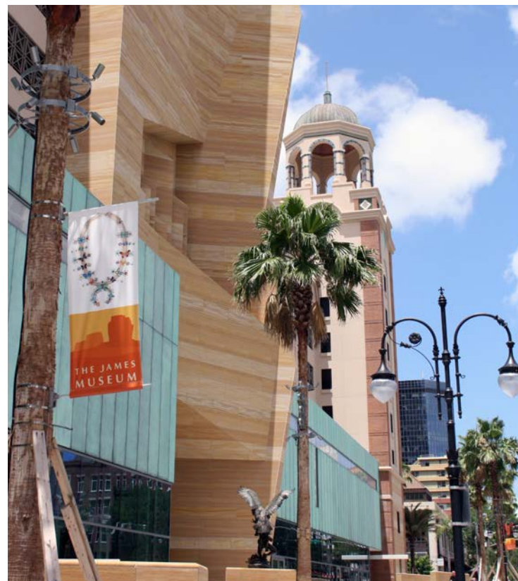
James Museum of Western and Wildlife Art.

3.2.4 Encourage museums and galleries to showcase minority and female artists, as well as to educate curators and collectors to advance minority and female artists.