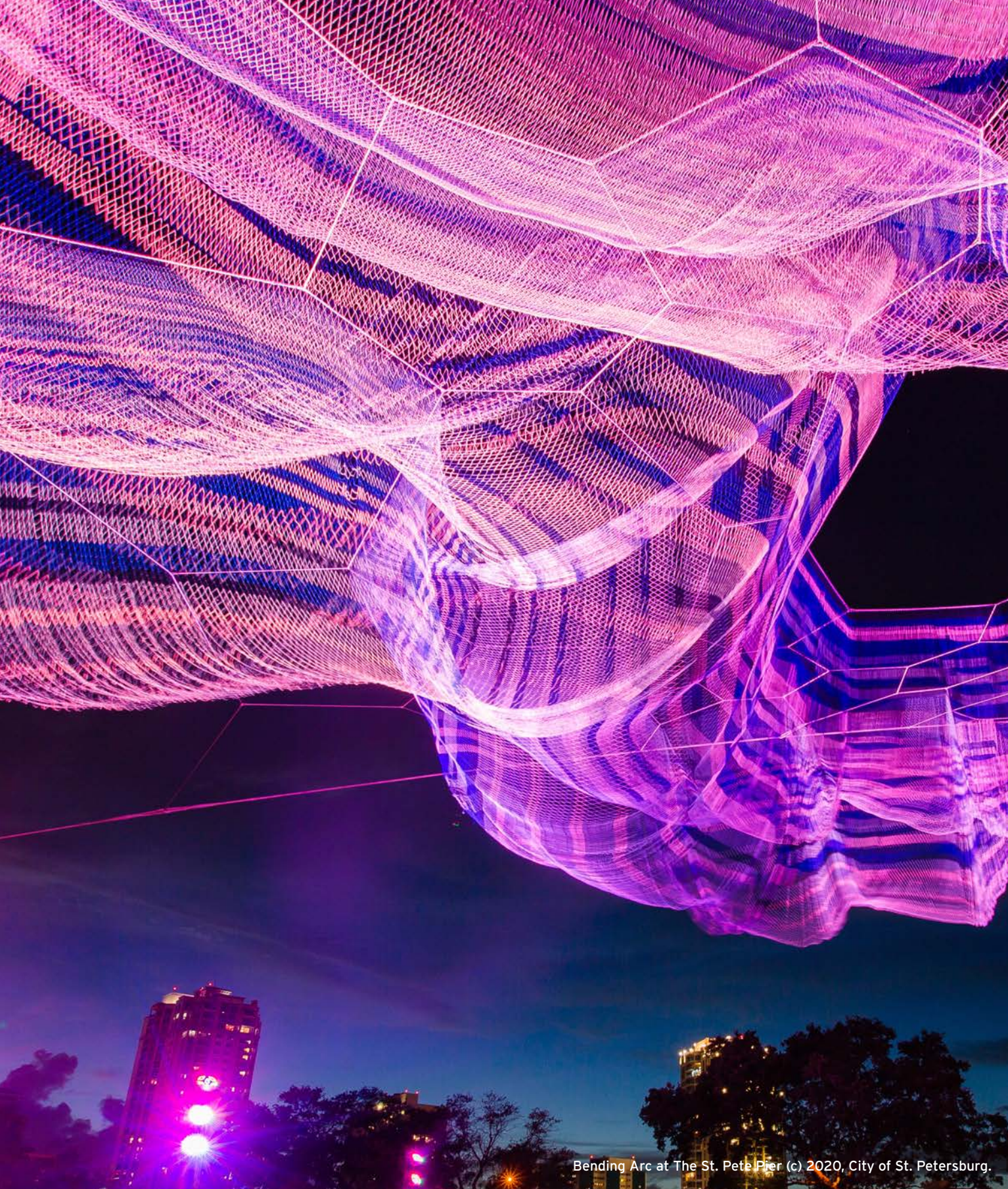
Bending Arc at The St. Pete Pier (c) 2020, City of St. Petersburg.