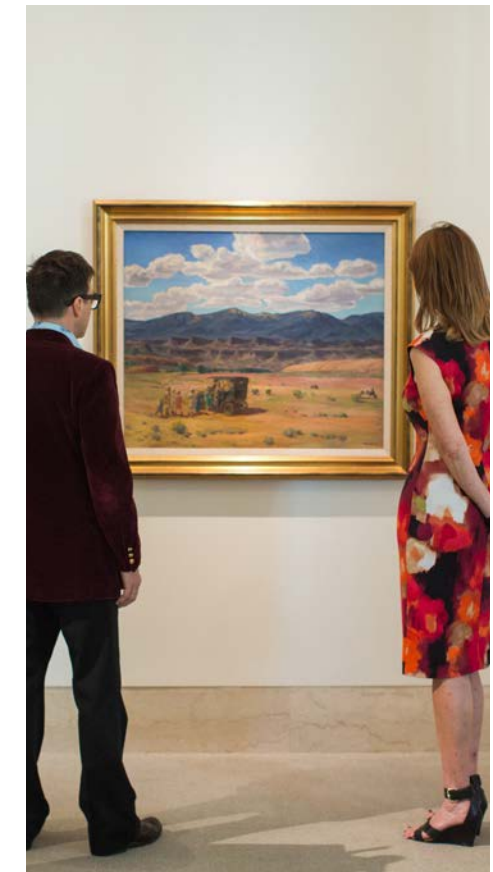
L: SHINE® Mural Festival, artwork by Michael Reeder. (c) 2017 City of St. Petersburg. C: Image courtesy of St. Petersburg Opera Company. Photographer Jim Swallow. R: Museum of Fine Arts. (c) 2016 City of St. Petersburg.