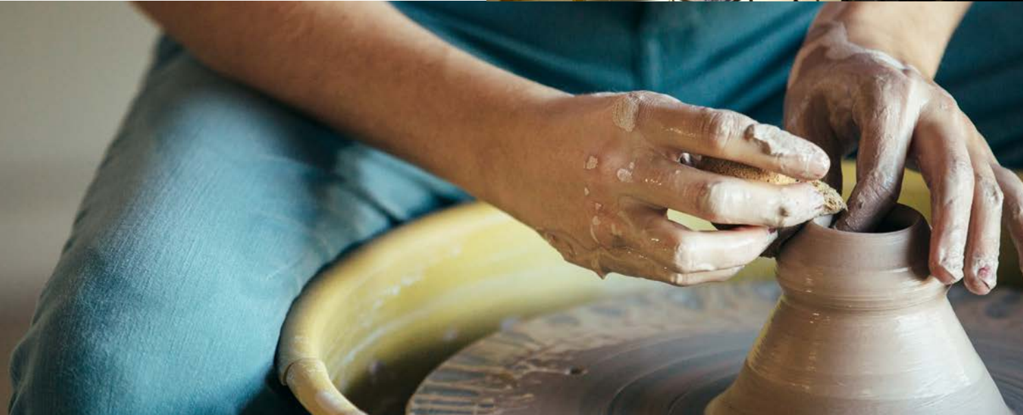
Above - Boxcar #113 069-5, Permanent Collection of The Florida Holocaust Museum. Below - Morean Arts Center For Clay