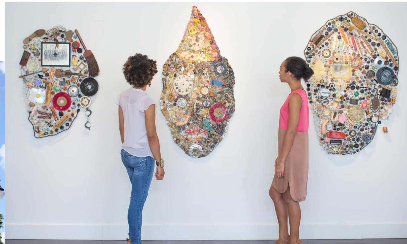
Florida Craft Arts St. Petersburg, Florida.

3.3.5 Seek project-based funds from the State of Florida and the National Endowment for the Arts. Engage professional lobbying services to promote arts funding.