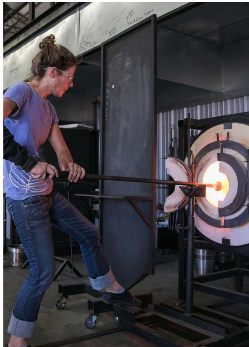
St. Petersburg Hot Glass Studio at Duncan McClellan Studios.